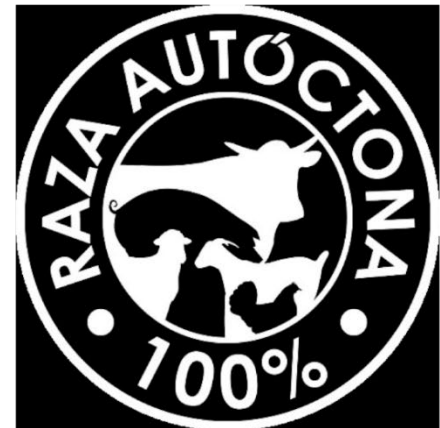
Raza autóctona 100% label. Ministry of Agriculture, Fisheries and Food.