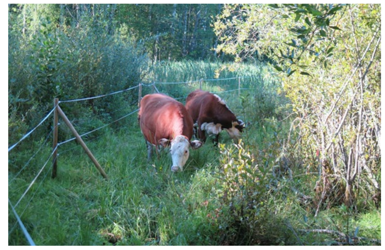
Figure 1. Forest grazing in the Höytiäinen canal estuary nature protection area, Joensuu, Finland.

Ruminants include, for example cattle, all domesticated and wild goats and sheep, and more. They are a valuable resource for mankind since the earliest human society. Ruminants are able to convert roughage feed (like grass, hay, food by-products not suitable for human consumption) into edible food product with high nutritive value proteins and microelements essential for our body (milk, meat). Moreover, ruminants can thrive well on poor productive land areas unsuitable for crop cultivation.