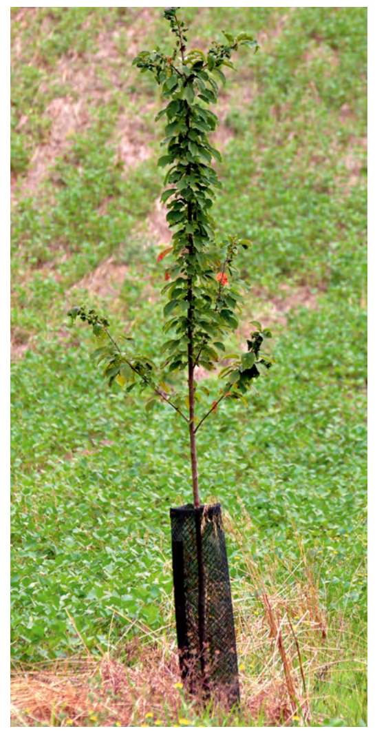
Give preference to mesh guards for protection of trees

Farmers need to be well acquainted with the different types of guards in order to use them properly and make the right choice for protecting their trees.