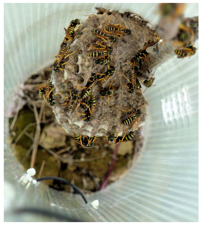
A wasp nest in a tree shelter

In the spring, the confined space created by the diameter of small tree shelters favours nesting of the wasps. With the summer, wasp activity and nest size increase. They proliferate and are made aggressive by the heat. During tree pruning, stings are frequent. The microclimate in tree guards is less favorable for wasps and it is rare to observe nests within them.