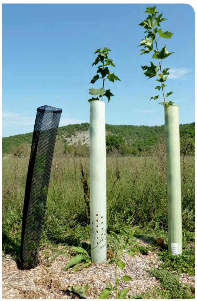
Mesh tree guard (left), ventilated (centre) and unventilated (right) tree shelters