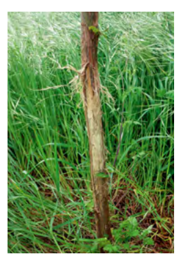
Rubbing (roe deer)