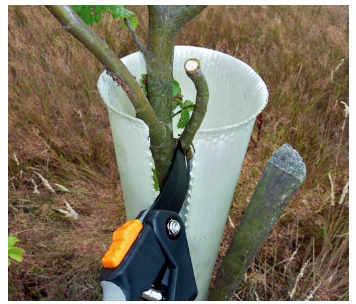
When it is impossible to remove the shelter to prune a tree, the only solution is to damage the tube

The diameter of the tree shelter is critical ( \leq 12 cm) because it constrains branches. It can be difficult to insert pruning shears into a narrow tube when removing the unwanted branches. A mesh tree guard of 20 cm in diameter is the ideal device to facilitate the work of tree pruning.