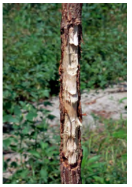
Bark girdling (rabbit)