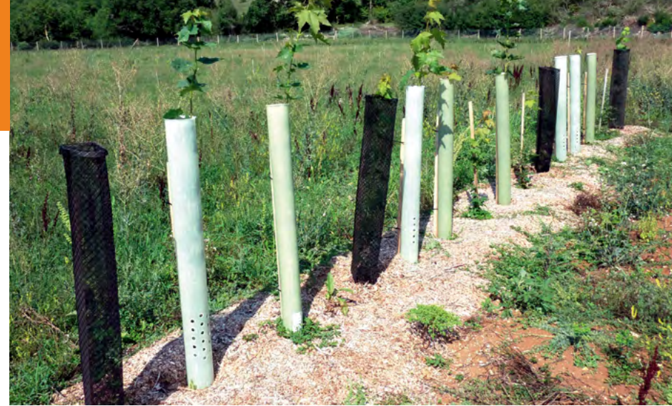
There are a number of ways to provide protection for individual young trees