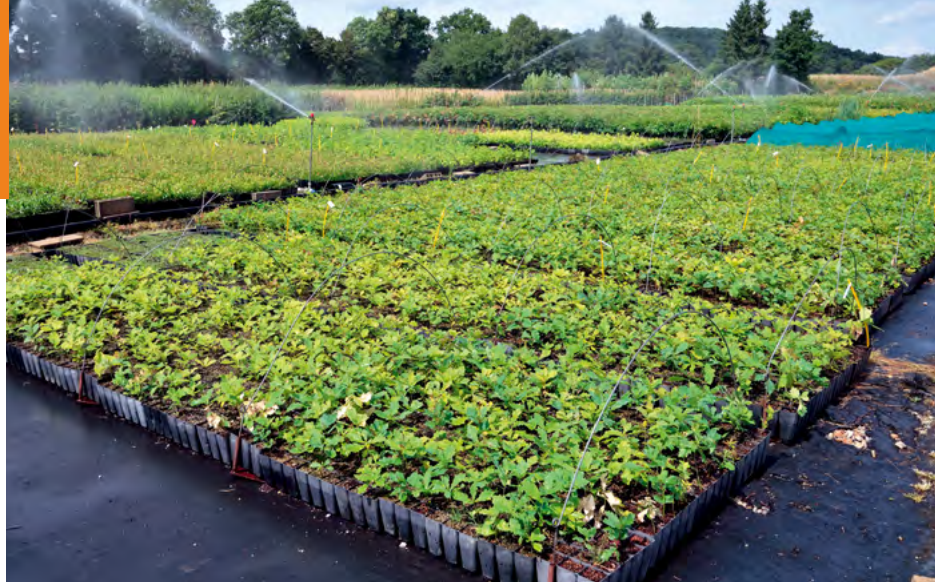
Pedunculate oak plants in rootballs