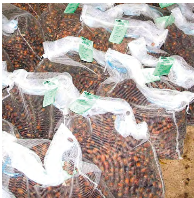
Sessile oak acorns