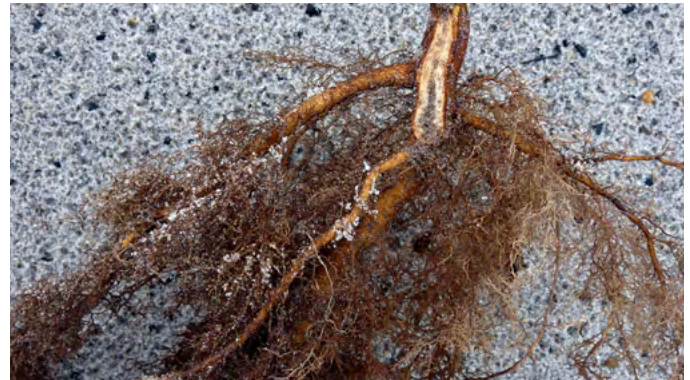
Norway maple with damaged collar: refused

The seedlings should have a smooth, straight and regular shaped stem without necrosis and cankers with a final bud in good condition. Do not purchase seedlings showing traces of fermentation, heat discoloration, with a stem with pronounced curvature or with a fork or a poor or absent branching, or moldy, dry or part-dry seedlings.