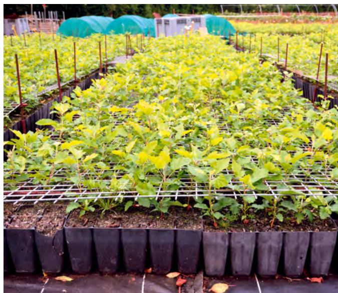
Sorbus torminalis seedlings in clod