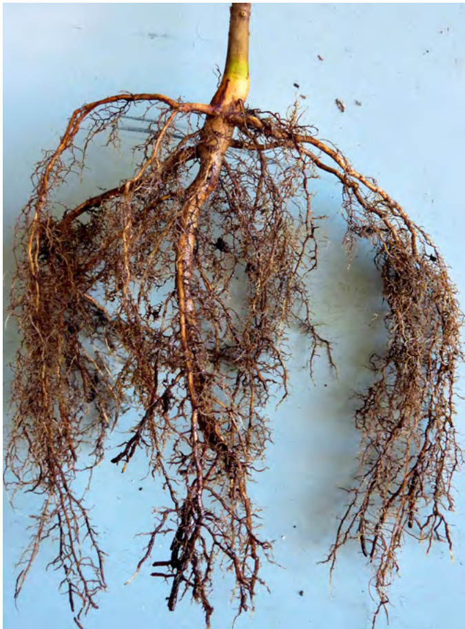
Norway maple with an abundant and compliant root system

Naked-rooted seedlings with apparent defects should not be selected. Look for: a damaged collar, a weak root system, cases where the primary root is tightly wound or twisted, damaged or absent rootlets. Seedlings in bucket with wounded side roots or roots rooting in the wrong direction (i.e. upwards) should not be selected.