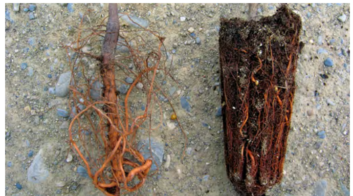
Atlas cedar seedlings in bucket with upgoing roots: refused