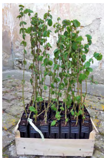
Crates of hazel seedlings in bucket