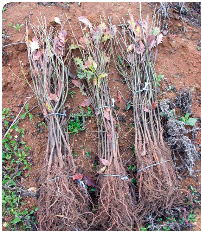
Bunches of bare-rooted seedlings from sessile oak

Nursery catalogs will provide details on the age , minimum and maximum height and minimum stump diameter of the root. Where possible try and inspect the quality of the seedlings prior to purchase by visiting stockists (or by reading reviews). Where possible purchasing seedlings that meet the European quality standards tend to result in more secure purchases. In some cases national standards are even stricter and may be preferred. There are a simple set of rules for seedlings selection: select the seedlings as young as possible, ideally with a high regeneration capacity producing new roots after plantation, prefer the vigorous seedlings or with the latest subculturing date. If the height of the seedlings is the same, choose the youngest one.