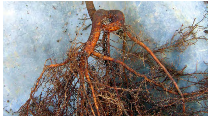
Red oak with roots displaying a hunting horn shape: refused