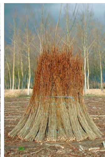
Bunches of poplar sets